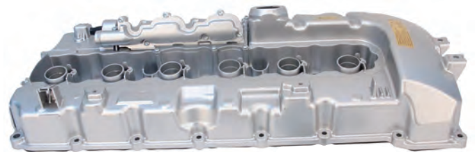
Engine Valve Cover