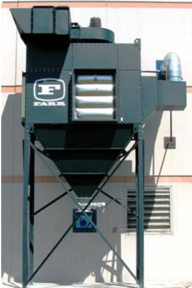
GS20 on Aluminum Shot Blasting

The Farr Gold Series cartridge dust and fume collector combines enhanced performance with ease of service while cleaning the work environment of irritating dust and fumes.