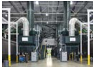
GS60 on blasting at National AL Railcar

The main caution is blasting aluminum. Extra safety precautions must be taken like explosion venting and installing the collector outside.