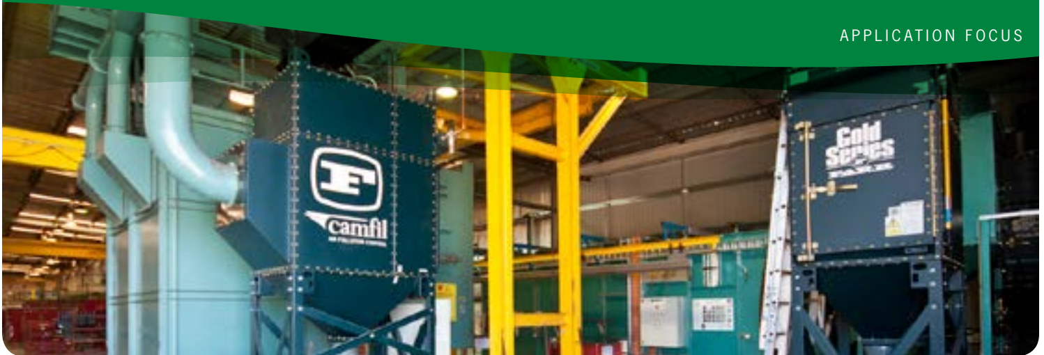
Two Farr Gold Series on abrasive blasting booths and booth recovery system.