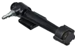
CT Cool Tube

Bullard Cool Tubes cool incoming air from breathing air sources by as much as 20-30° F (11-17° C). These cool tubes feature adjustable airflow control valves that allow the user to adjust the incoming air temperature to a level best suited to individual comfort. Bullard Cool Tubes include Models AC1000 (for use with compressed air), Frigitron2000 (for use with Bullard ADP20 and EDP30 Free-Air® Pumps) and ACL99 (for use with Lancer Series respirators). Accessories include leather heat shield and assorted belts.