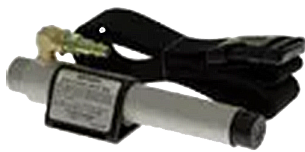
Cool Tube Assemblies

Bullard offers six belt-mounted climate control devices for use with Bullard airline respirators. Each system enables a worker to adjust and control the temperature of the air delivered to the respirator.