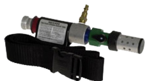
Hot/Cold Tube Assemblies

The latest innovation in climate control... the CT Cool Tube helps maintain worker comfort and maximize productivity when working in extremely hot and humid environments. Lightweight and comfortable, weighing 3.8 ounces, the CT cools incoming air by as much as 32°F while directing hot air away from the body. Equipped with an exhaust filter that protects against paint overspray and extends the product life. The CT Cool Tube is available with the DynaSwivel fitting for greater mobility.